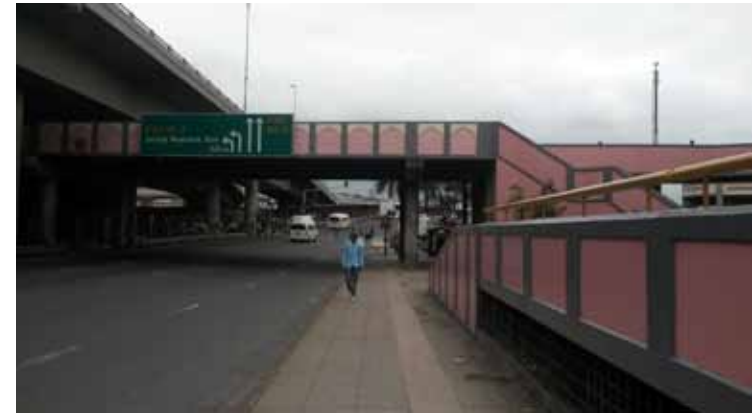
5. Between Victoria Market and African Market