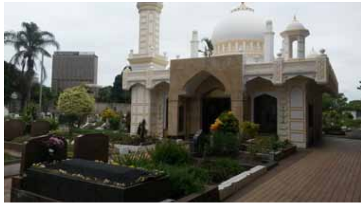
3. West cemetery: muslim, christian, jewish