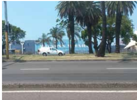
7. Wilson Warf