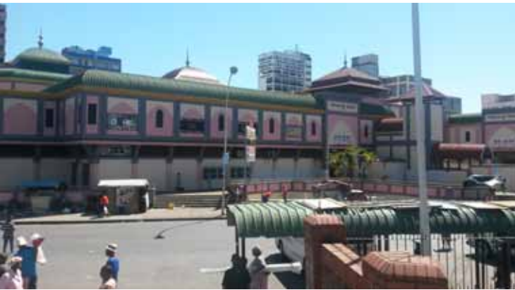
5. Victoria Market (indian market)