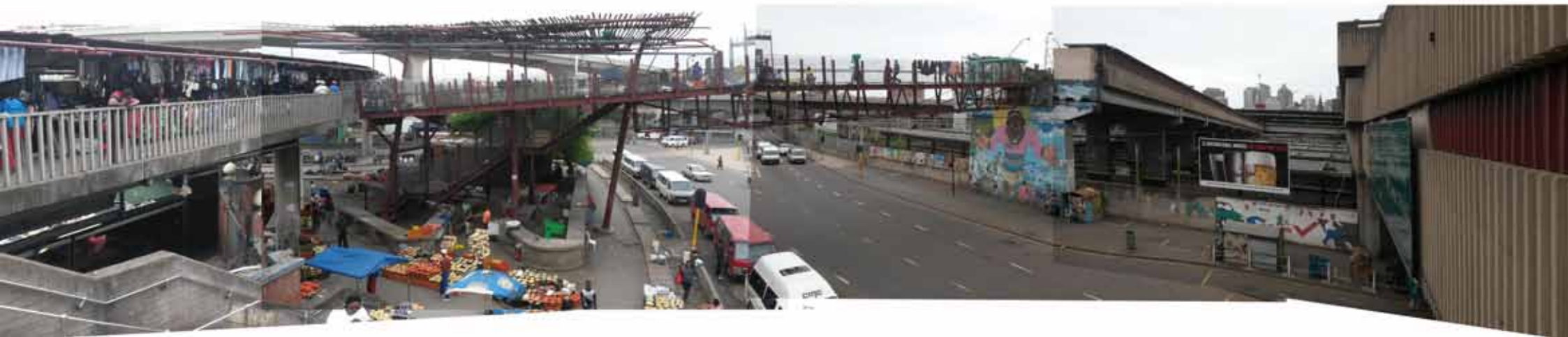
1. Warwick Junction