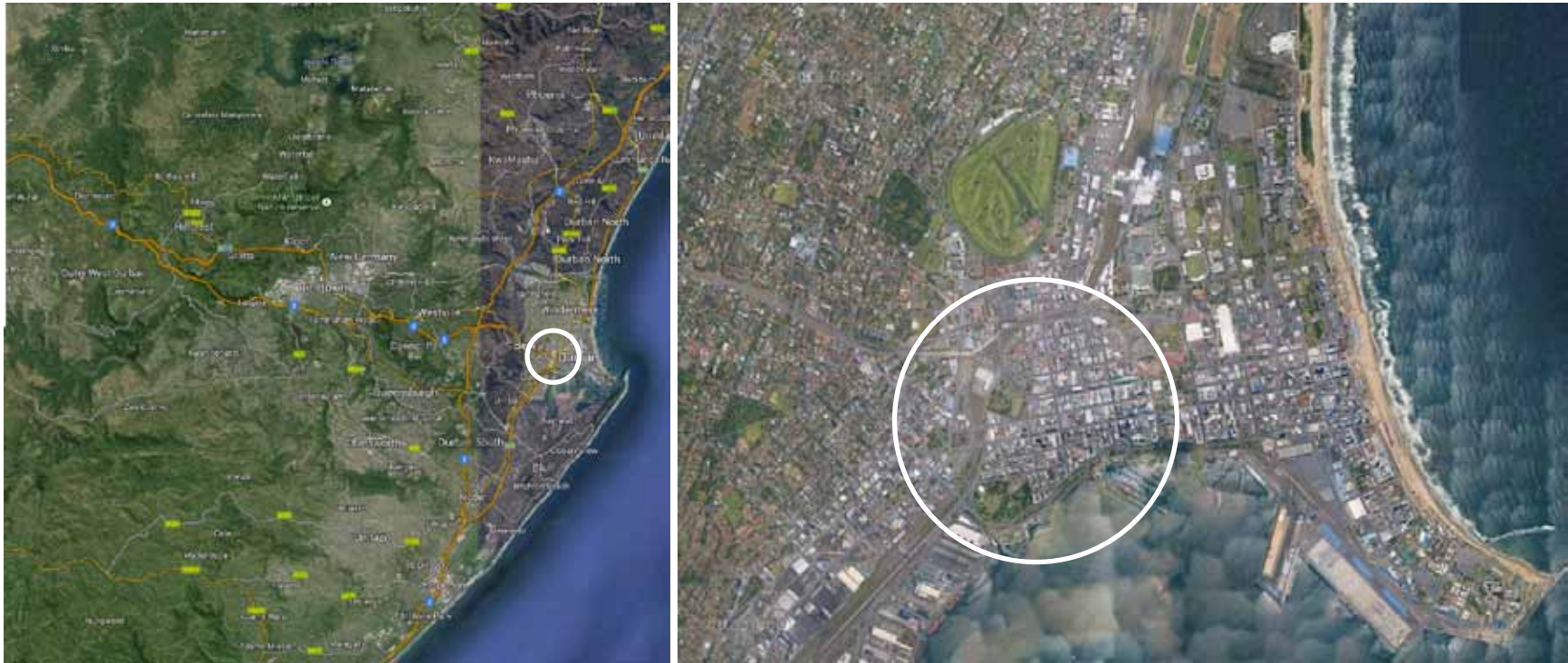
Durban, South Africa