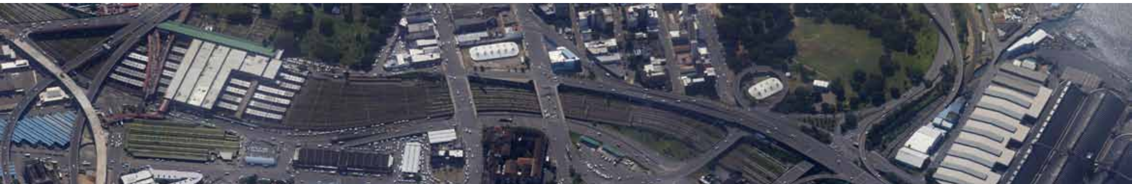
2. From Warwick to the Waterfront: urban path