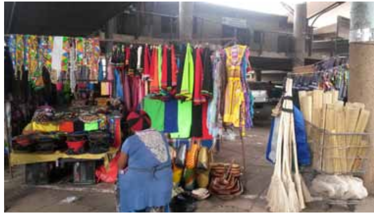
3. African market between Berea St. and West cemetery