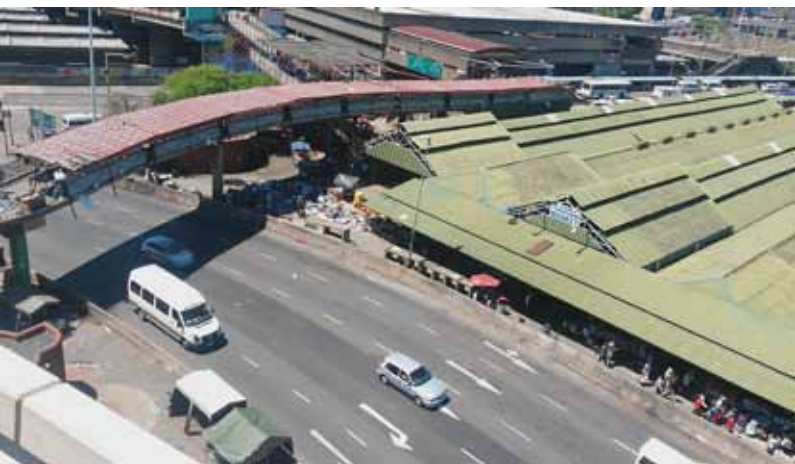
1. Warwick Junction, Early Morning Market