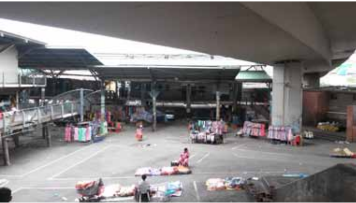
3. African market close Berea Station