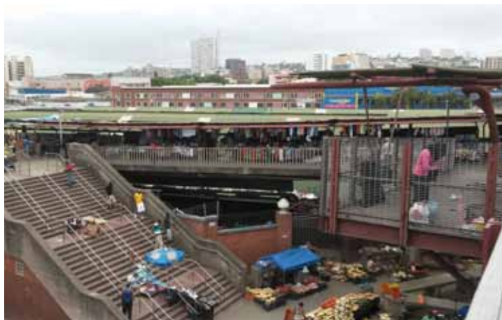
Berea Station, Early Morning Market