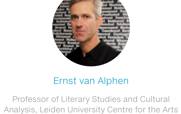
in Society, The Netherlands "The Temporality of Cultural Analysis"