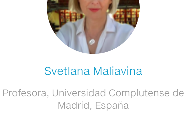
"Viajes reales e imaginarios: España y Rusia, una fascinación a distancia" (In Spanish)